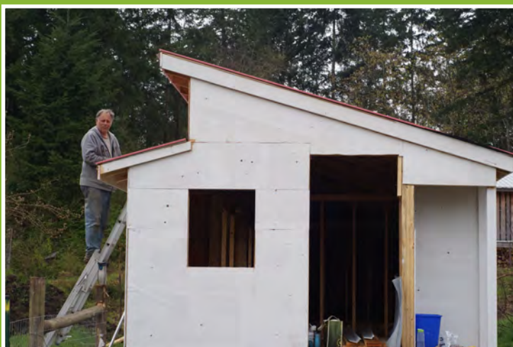
... the roof