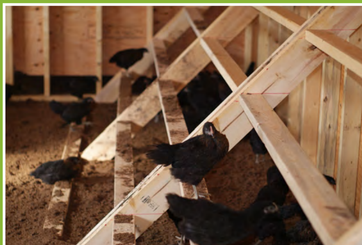
and finally ...the chickens.