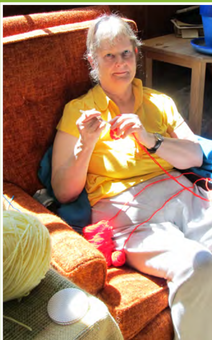
knitting in a sunbeam