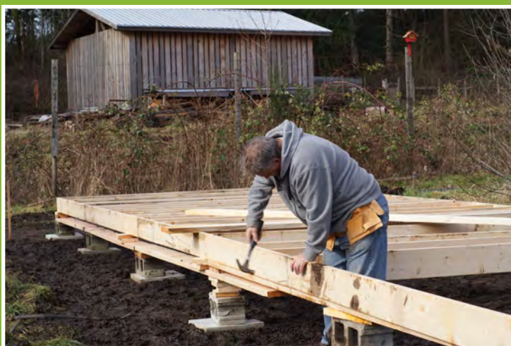
First things first ...the floor